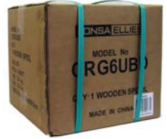
Wooden Drum 305m Packaged