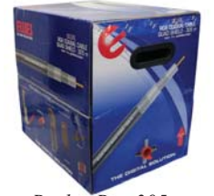
Reellex Box 305m