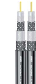
Siamese Quad Cable