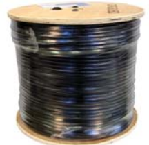
Wooden Drum 305m