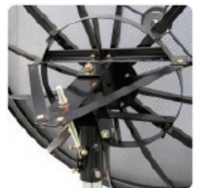
D-ST7 Polar Mount