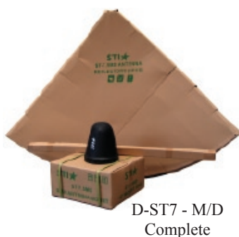
D-ST7 - M/D Complete