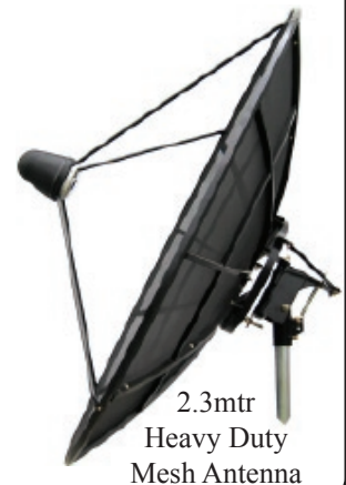
2.3mtr Heavy Duty Mesh Antenna