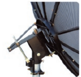
D-ST7MD Polar Mount