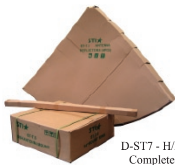
D-ST7 - H/D Complete